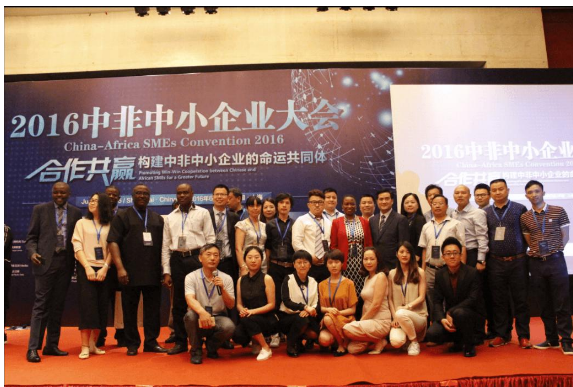
Group photo during The 1 st China-Africa SMEs Convention 2016

After successfully organizing The 1 st China-Africa SMEs Convention in Shanghai in June 2016, that gathered about 500 Chinese and African Companies, we are holding the 2 nd Convention in April, 2017 again with the purpose of helping Africa build a solid SMEs sector. Like the first convention, this second convention will help African SMEs trade and partner with Chinese SMEs, learn from the experience of Chinese SMEs and find opportunities for investment from African and Chinese investors. The second Convention will be held from April 10 th -13 th , 2017 in Shanghai, China.